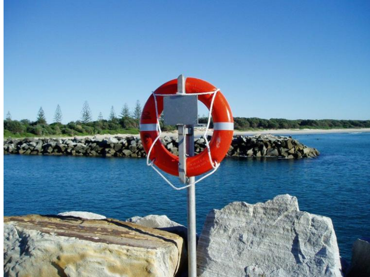
New South Evans Head Break Wall Angelring